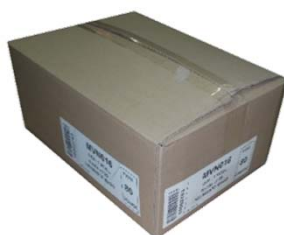
Cartons of 150