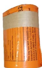
Rolls of 25