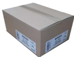
Cartons of 250