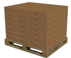
105 cartons per pallet