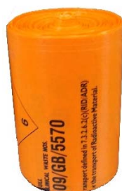
Rolls of 50