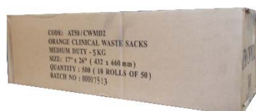
Cartons of 500