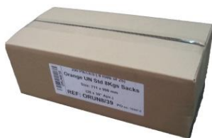
Cartons of 200