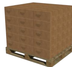
75 cartons per pallet