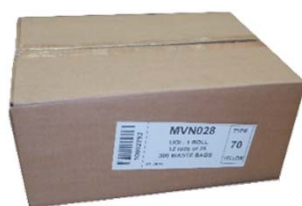
Cartons of 300