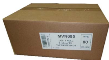
Cartons of 150