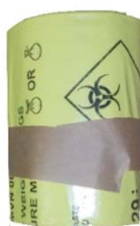
Rolls of 25