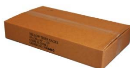
Cartons of 200