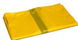
Folds of 50