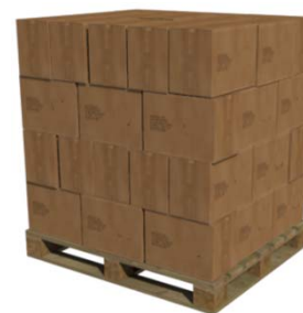
45 cartons per pallet