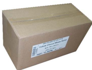
Cartons of 400