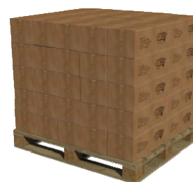
63 cartons per pallet