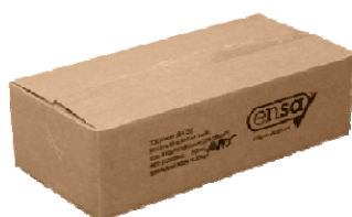
Cartons of 100