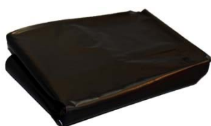
Folds of 25