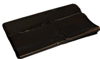
Folds of 25