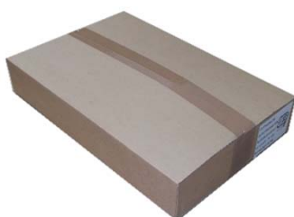
Cartons of 100