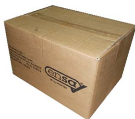
Cartons of 100