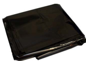
Folds of 25