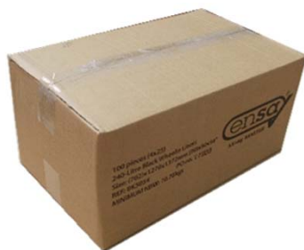
Cartons of 100