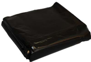
Folds of 25