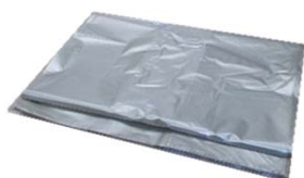
Folds of 25