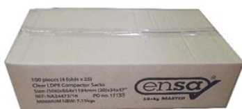
Cartons of 100