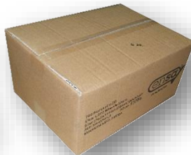
Cartons of 100