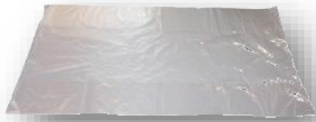
Folds of 25