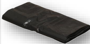
Folds of 50