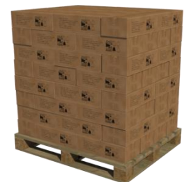
99 cartons per pallet