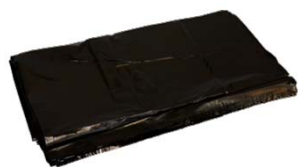
Folds of 25