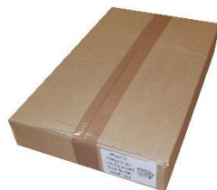
Cartons of 200