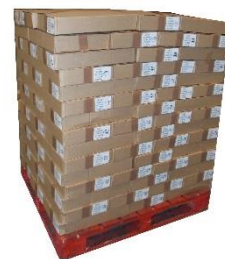
56 cartons per pallet