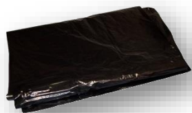
Folds of 25