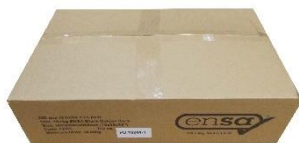
Cartons of 200