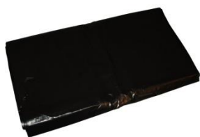
Folds of 25