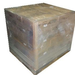
49 cartons per pallet