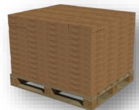
256 cartons per pallet