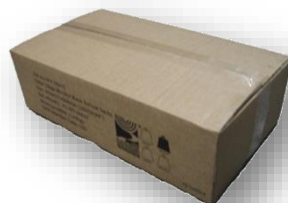
Cartons of 200