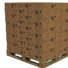
120 cartons per pallet