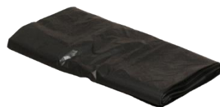
Folds of 50