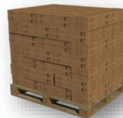
120 cartons per pallet