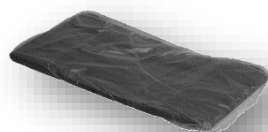
Polypacks of 50