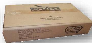
Cartons of 200