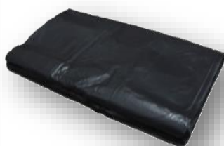
'Z' fold of 200