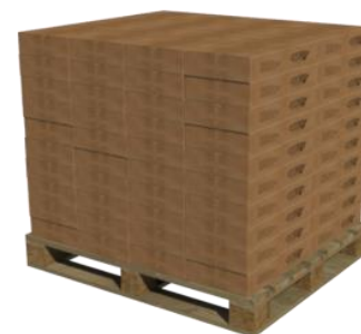
99 cartons per pallet