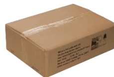
Cartons of 200