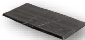
Polypacks of 50