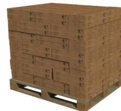
120 cartons per pallet