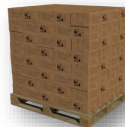
63 cartons per pallet