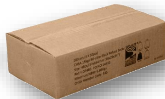
Cartons of 200