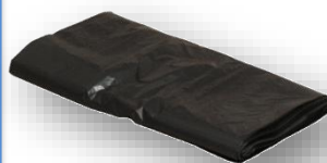
Folds of 50