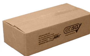
Cartons of 200