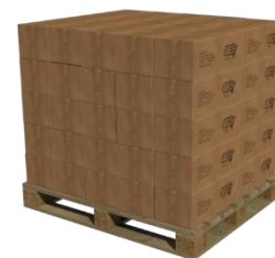
48 cartons per pallet