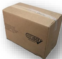
Cartons of 200