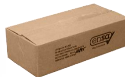
Cartons of 200