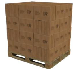
45 cartons per pallet