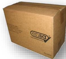
Cartons of 200