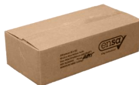
Cartons of 200