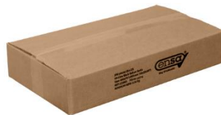
Cartons of 200