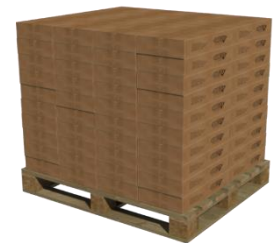
120 cartons per pallet