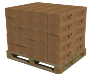
42 cartons per pallet