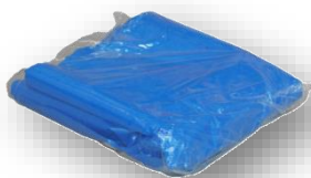
Polypacks of 50