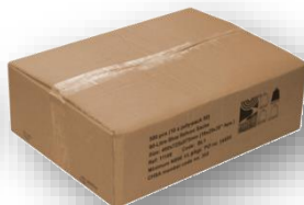
Cartons of 500