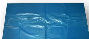
Folds of 25