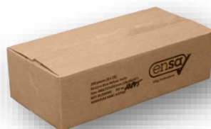
Cartons of 200