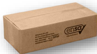
Cartons of 200