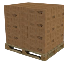
72 cartons per pallet