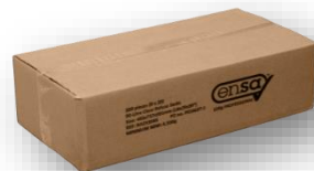
Cartons of 200