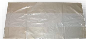
Folds of 25