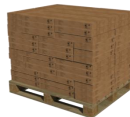
120 cartons per pallet