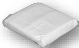
Polypacks of 50