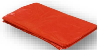
Folds of 25