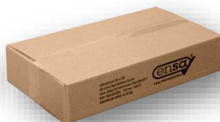
Cartons of 200