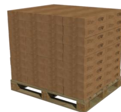
72 cartons per pallet