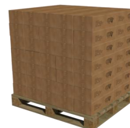
72 cartons per pallet