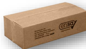
Cartons of 200