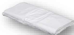
Folds of 25