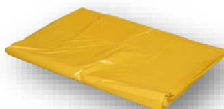
Folds of 25